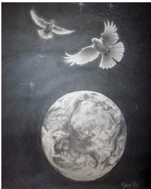
Original Artwork by Nakai Losett, ©2023