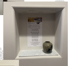
Nooks in our entry