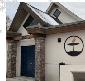
New front door!

To find out more about LGBTQ+ Welcoming Days of Observance, visit uufbozeman.org/welcoming .